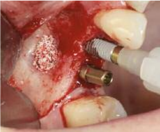
Fig. 10 Inserting the two Bone Trust Plus implants.