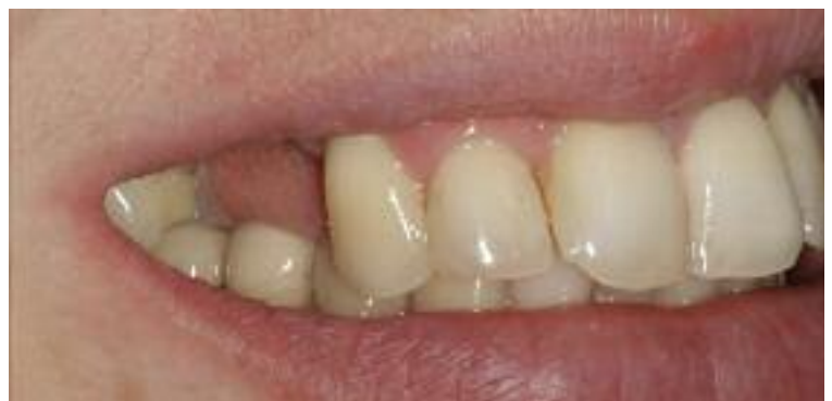
Fig. 17 Lip profile of the patient prior to insertion of the implant-supported superstructure.