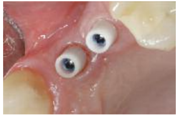
Fig. 15 Situation prior to cementing the crowns.