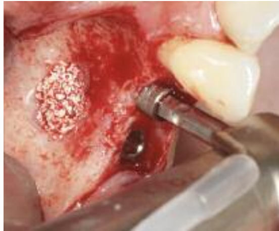
Fig. 11 Positioning the final implant.