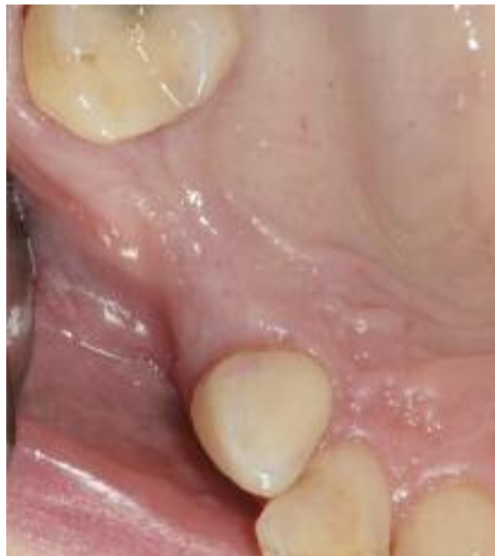
Fig. 1 Clinical baseline situation with missing teeth 14 and 15.

After complete preparation of the implant cavities, we continued by augmenting the sinus cavity with a bone regeneration material, which we had mixed