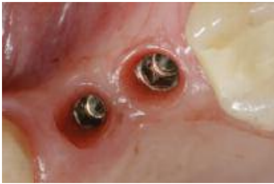
Fig. 14 The exposed Bone Trust Plus implants.