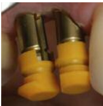
Fig. 16 Repositioning pressure posts.