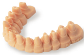
Indirect Bonding Tray