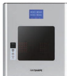
ShapeCure UV Curing Dryer