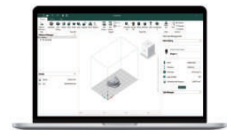
ShapeWare Powerful 3D Printing Software