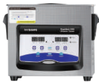
ShapeWash 020S Ultrasonic Cleaning Machine